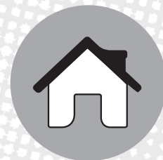
Nine months' rent