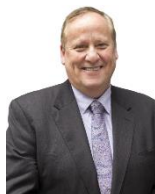
HON DON PUNCH MLA MINISTER FOR REGIONAL DEVELOPMENT