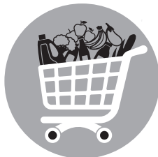
Groceries for the family